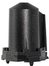
Ink cartridge P1-S-BK for absorbent surfaces

Adheres to: Paper, cardboard, wood, stone/brick